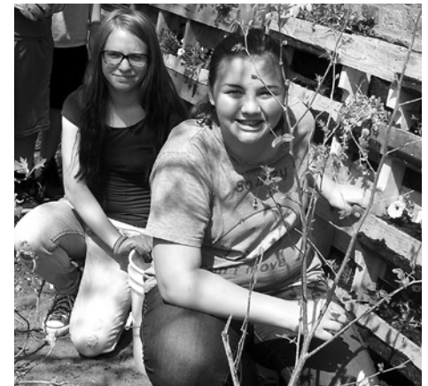
Top left corner, Franklin Middle students raise $1,600 for Roswell Park "Bald for Bucks" initiative. Top right, Lindbergh students welcome Fred Jackson as part of a special NFL Play 60 event in May. Above, Kenmore Middle students create vertical gardens using pallets.