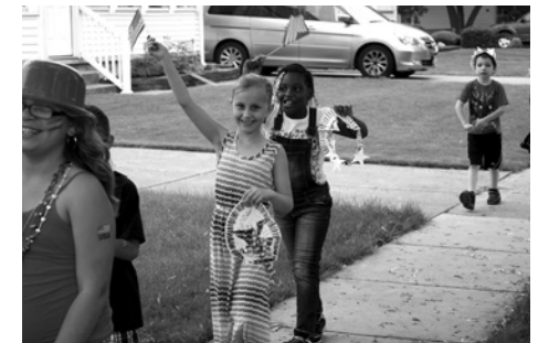
Graduation photos from Kenmore East High School (top left) and Kenmore West High School (top middle). Top right, the first graduating class from the Big Picture Program is honored during a special celebration. Above, Holmes Elementary students celebrate Flag Day with a parade.