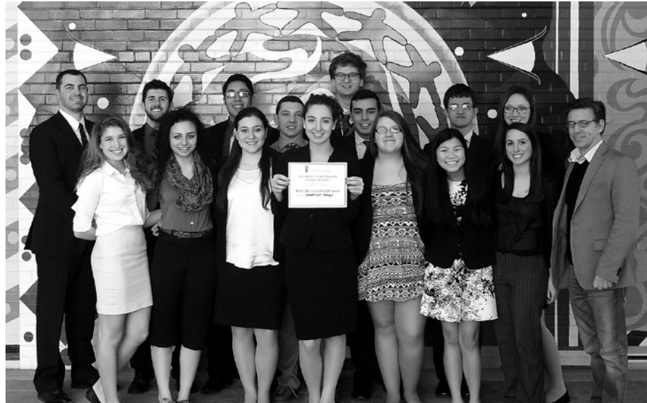
Top left, hundreds take part in activities at Edison Elementary's carnival-themed Wellness Night in March. Above, Ken-East students win the regional Model UN competition for the 12th year in a row. Top right, a team of three Hoover Middle students win the regional History Day competition and go on to compete at the state level.