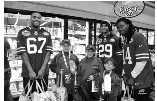
With the help of the Food Services Department, the Dairy Council, the American Dairy Association, United Way of Buffalo and Erie County, the NFL and the Buffalo Bills, students from Holmes Elementary took part in a special Hometown Huddle event, where they learned about good nutrition and had the opportunity to shop at Wegmans with Bills rookie players, in October.

When at this site, choose the “make online payment” option. Here you can register your child/children with Nutrikids. Upon completing the registration process you will be able to make payments and view transactions on each account you have registered. A convenience fee of $1.95 is applied for each payment made online.