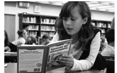
Bottom left, the Edison Elementary Pumpkin Run. Top left, Franklin Middle students celebrate Oktoberfest. Above, a Franklin Elementary student takes part in a Columbus Day reading activity with students from the middle school.