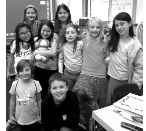
Top left corner, eight sets of twins welcomed to Hoover Middle School as part of last year's sixth-grade class. Bottom, East vs. West football. Above, Lindbergh students who helped raise $1,300 for breast cancer research early last fall.