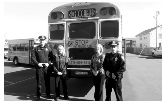
The Town of Tonawanda Police and other law enforcement agencies team up with the Transportation Department for Operation Safe Stop in April to promote safe driving around school buses.