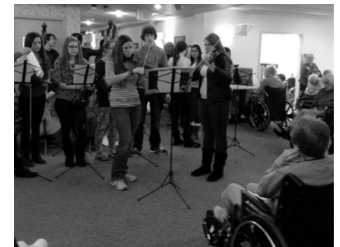
Bottom left corner, Ken-West band members put on a special holiday concert and instrument demonstration for students at Edison Elementary and Hamilton Elementary. Top, K-Kids members at Roosevelt Elementary make holiday cards for nursing home residents. Above, left, the Kenmore Middle School Chorus' holiday concert; right, Ken-East Orchestra members perform holiday music at a local nursing home.