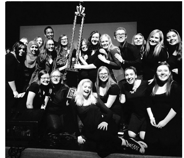
Top left corner, the combined Kenmore East High School and Kenmore West High School Lacrosse Team goes on to win the Section VI Independent championship during the 2015 season. Above, left, Kenmore West High School art students decorate a dumpster for Earth Day. Above, right, Kenmore West High School students pose with their trophy after winning the third annual Band Against Bullying Competition at the UB Center for the Arts in April.